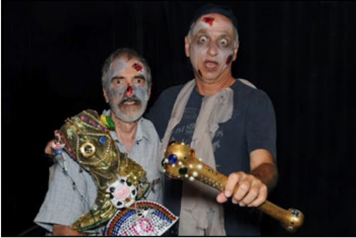
These zombies never imagined they would win the Honky Tonk Queen Contest in 2012. It could happen to you in 2013!

We are planning to make this year's contest a truly fabulous one, a fitting match to IAGSDC's fabulous 30th convention. There will be Old Queens, new queens, guests from San Francisco's wonderful drag scene, celebrity judges, and more - all to delight and amaze you, our audience! So mark your calendars, and prepare for a evening of fantastic entertainment!