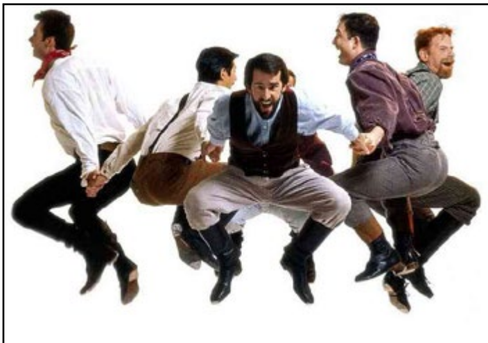
The Barbary Coast Cloggers will perform at the Country & Western dance on Saturday.

We are planning to make this year's contest a truly fabulous one, a fitting match to IAGSDC's fabulous 30th convention. There will be Old Queens, new queens, guests from San Francisco's wonderful drag scene, celebrity judges, and more - all to delight and amaze you, our audience! So mark your calendars, and prepare for a evening of fantastic entertainment!