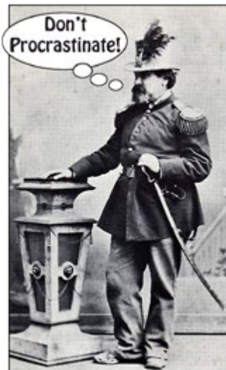
Another decree from Emperor Norton I of San Francisco