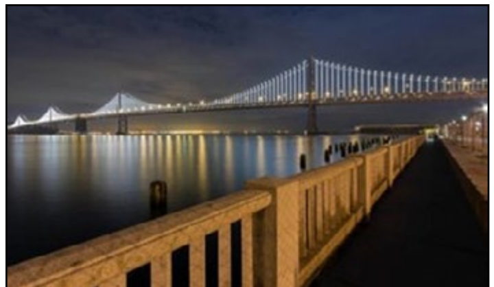
The Bay Lights from San Francisco's Embarcadero

ALL OF SAN FRANCISCO IS TALKING about the Bay Lights , the new lighting installation on the San Francisco Bay Bridge. Just opened in March 2013, the Bay Lights is the world's largest LED light sculpture, 1.8 miles wide and 500 feet high. Inspired by the Bay Bridge's 75th Anniversary, its 25,000 white LED lights are individually programmed by artist Leo Villareal to create a never-repeating, dazzling display across the Bay Bridge West Span through 2015.