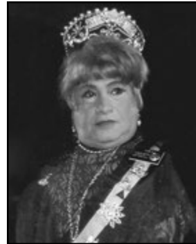
Empress Jose I, the Widow Norton (Jose Sarria), noted gay activist and founder of San Francisco's Imperial Court System

Get your act together! It's time to start working on your costume and routine! You can't be Empress, but you could be our next Honky Tonk Queen!