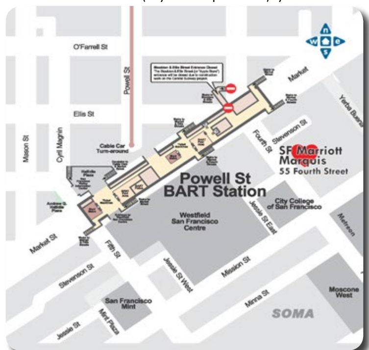
Powell Street BART station and the hotel