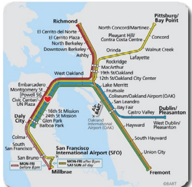
The BART (Bay Area Rapid Transit) system

Our hotel is at 55 Fourth Street (780 Mission) , a block from the Powell Street BART station. Powell Street is a major transit hub where you can catch BART and the San Francisco Municipal Railway (MUNI) light-rail cars, buses and cable cars to go all over town.