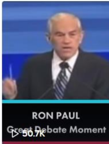
Ron Paul destroys Rick ...